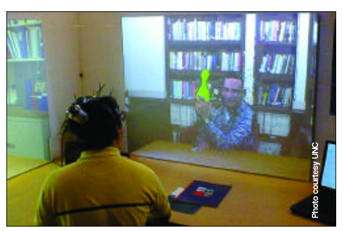
In 25-30 years you'll see Future VR technologies will evolve beyond the holographic image people moving to places shown above to include other senses, including sound and touch.

One day in the future, people will look back at today's business aviation travel and say, "We did this because we didn't have proper means of communications." They'll gain an understanding of today's business travel from reading history books that explain that we didn't have well-